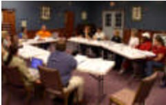
Welcome Session Board Meeting 06