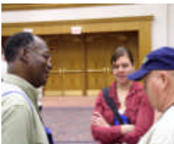
Members Mingle 06 ACA Nat. Conf.

Winners of the 2006 AWARDS presented at the HOS Regional Conference.