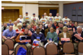
Woodmen of the World presents 50 non-profit camps with American Flags to HOS members. 06 ACA Nat. Conf.